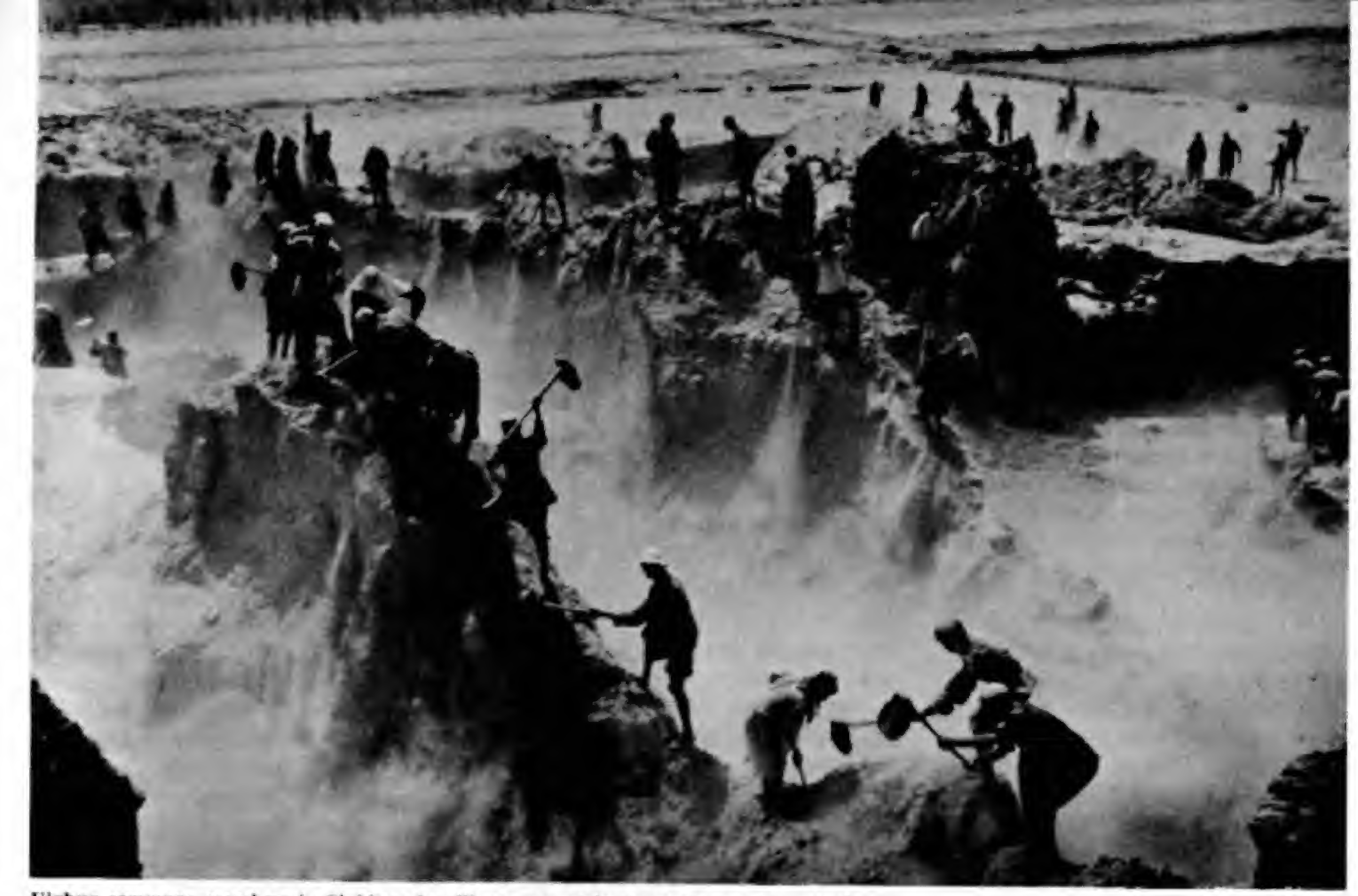
Uighur commune members in Sinklang levelling a mountain to create new farm land,

Hopei province, which was hit by severe earthquakes last March. Its commune members, armed with Mao Tse-tung's thought, conquered difficulty after difficulty to wrest from the soil the biggest harvest in many years.